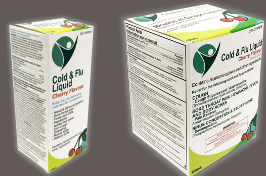
The "footprint" of this folding carton packaging significantly increases after incorporating compliant content and design